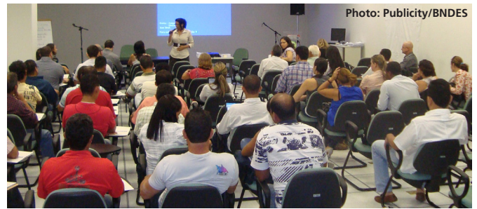
Meetings offer answers to questions on public calls-to-bid

Meetings will be open to the general public, but focus mainly on applicant organizations, which offer support